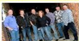
The Castaways Saturday Noon