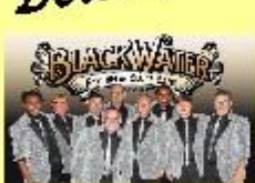
Blackwater Rhythm & Blues Band Saturday Night